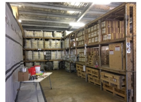
The funds raised will be used to provide immediate and longer term assistance through Caritas Tonga.

Visit www.caritas.org.au/donate/emergency-appeals/pacific or call 1800 024 413 toll free to make your donation.